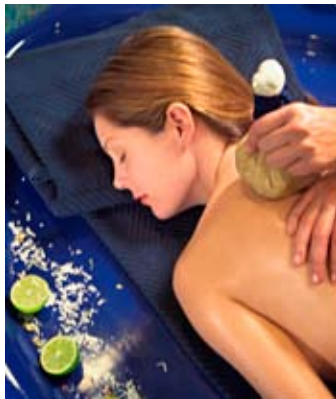
STROKES OF GENIUS: (top to bottom) Caption TK; Caption TK.

The options for vacation experiences are as vast as the landscapes, and golfers enjoy a particularly rich array of choices.