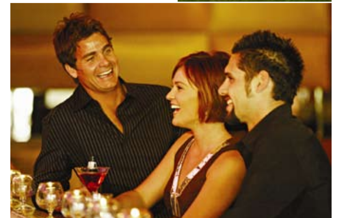
DRINK IT IN: (top to bottom) The Boulders; Troon North; Caption TK.

FOR YOUR FREE ARIZONA TRAVEL PACKET, VISIT arizonaguide.com